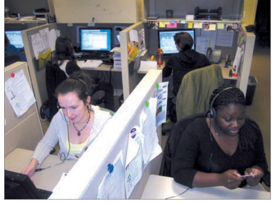
The NAF Hotline then and now: operators in the 1990s (above left) and today (above right).